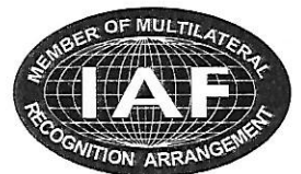
Vice President - AJA Registrars Inc.

This certificate is issued in respect of the locations & scope of registration detailed in the Associated Registration Schedule. This certificate is the property of AJA Registrars Inc., 2nd Floor JD Tower Commerce Avenue, Madrigal Business Park, Ayala Alabang, Muntinlupa City 1770, Philippines and must be returned on request. A member of the AJA Group of Companies